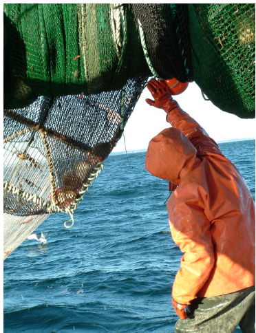
Normore grate